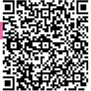
Scan & Sign up!